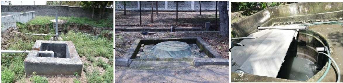
Fig. 9. Water collection and reservoirs tanks