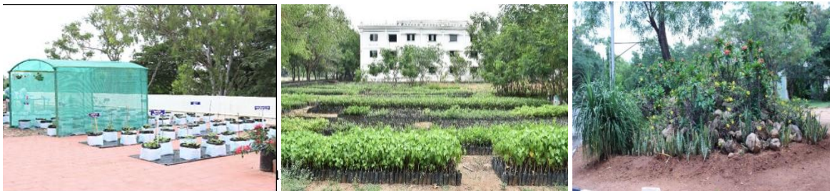
Fig. 4. Establishment of different types of gardens

Medicinal and herbal plant gardens can be maintained in the backyard of the campus. In the tree gardens, trees as linings all over the campus can act as oxygen corridors. Native trees along with trees like Azadirachta , Pongamia , and Ficus species can be cultivated at the maximum as these plants are used to remove the dust particles and carbon lead from the air and purify the air considerably. Similarly, the ornamental plants with beautiful flowers can be maintained in the frontage gardens of campus for attraction and good ambiance. This will give an overall