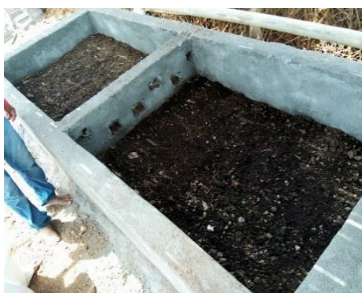
Fig. 7. Vermicompost Unit

Growing fish in small ponds will keep the environment pleasant. In the closed environment like corridors and the front offices, auditoriums and gallery classes placing the fish aquarium as well as plant aquarium will improve the