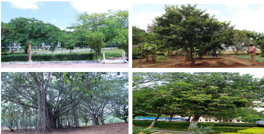
Fig. 10. Oxygen Releasing and Carbon Dioxide Assimilating Plants