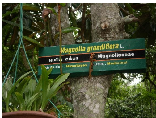
Fig. 5. Labelling of common as well as botanical names of Plants

Maintaining the green campus and water conservation mechanisms should be applied efficiently on the campus. Well-planned water irrigation systems like sprinklers and drip should be implemented in the entire green area of the campus for an effective water management system. This can be implemented only when the plantations are well planned. The tree growing areas can be connected with drip irrigation and medicinal plants growing areas and flower gardens can