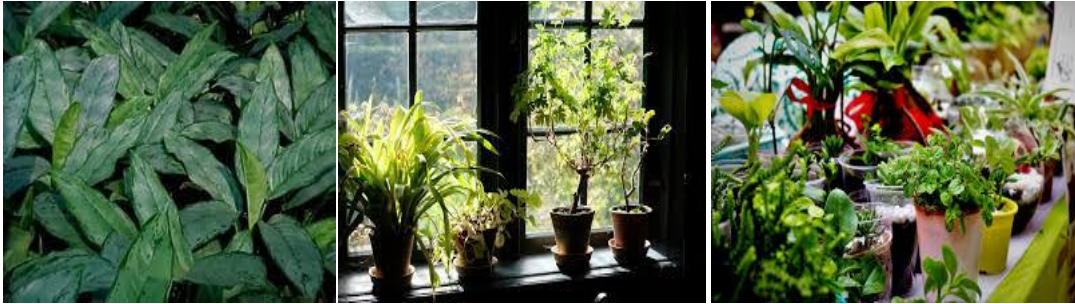
Fig. 8. Features of indoor plants to absorb ultrasound (Acoustic)

the atmosphere (Tiyarattanachai and Hollmann, 2016). In general, the campus should have a maximum number of more oxygen-producing and CO 2 absorbing plants such as Areca Palm , Money plant , Neem , Tamarind , Ficus , Bamboo , Arjun , Magizhamboo , Marudhu , Maramalli , Nettilingam , Manjal arali , Puvarasu , and Pongam trees to give pure atmosphere to the stakeholders (Fig. 10).