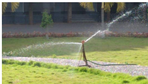
Fig. 6. Operation of sprinkler irrigation methods

Natural or eco-friendly methods should be used to grow plants vigorously on the campus. Use of biofertilizers, organic manures (cow dung, vermicompost, and plant wastes and litters), and green manures to grow healthy plants in the medicinal plant garden, kitchen garden, and terrace garden should be ensured to keep the campus organic. Plant waste such as fallen leaves, stems, fruits, nuts, seeds, and other plant parts should be used to make green manures.