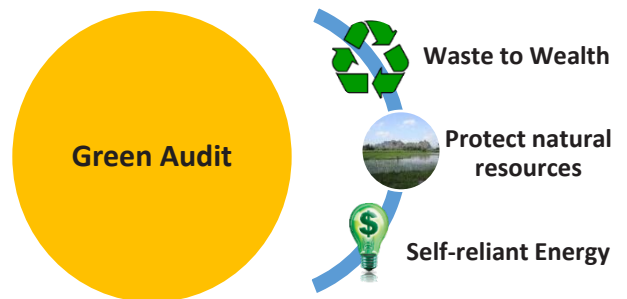
Fig. 2. Green campus audit practice and benefits

A fresh green campus audit is required for any new (or) old organization to self-evaluate one's needs with respect to environmental objectives and implementation. To have continuous monitoring and implementation of self-sustainable practices, the green audit has to be practiced once a year with updated practices and with consistent improvement in all the mentioned sections of protecting the environmental objectives (Fig. 2). Mere practice and insist on a green campus audit is to create a self-sustainable organization that doesn't affect nature and assists in protecting the natural resources, earth, ecology, and biodiversity (Venkataraman, 2009). The audit helps to assess the strength and weaknesses of any organization on their self-sustainability in the long run in terms of green campus planning and efforts (Aruninta et al. 2017). The Indian Green Building Council (IGBC) is a division of the Confederation of Indian Industry (CII), which was set